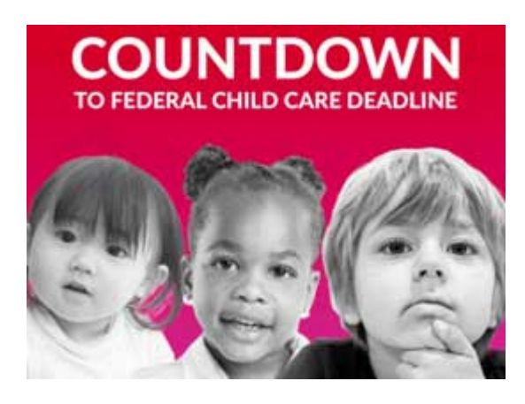
March 31 is the deadline to sign the federal