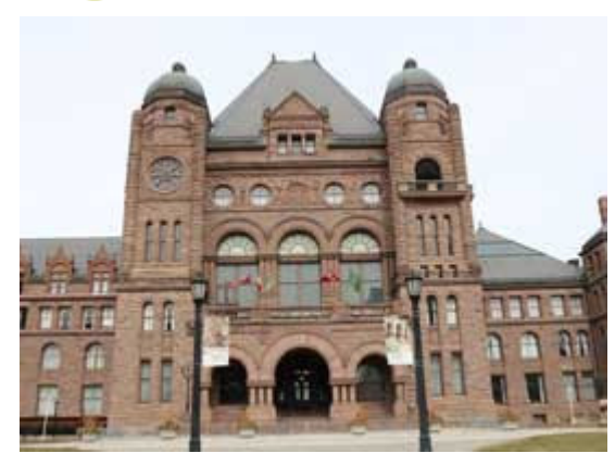
Ontario Regional Council begins next week, with health care, child care and the upcoming provincial election on the agenda.